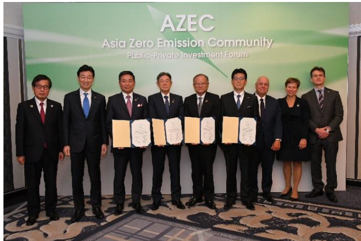
AZEC Public-Private Investment Forum

commercialization demonstration project under this Green Innovation Fund and to develop an international supply chain for liquefied hydrogen.