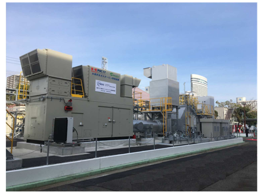
Demonstration plant of hydrogen-fueled gas turbine cogeneration system

Technology verification tests, supplying electricity and heat generated by the hydrogen-fueled gas turbine cogeneration system to nearby facilities in Kobe City's Port Island, are planned to start in this fall. And hydrogenbased power generation operation stability with dry low NOx combustion technology, electrical efficiency improvement, and environmental load reduction effects will be investigated.