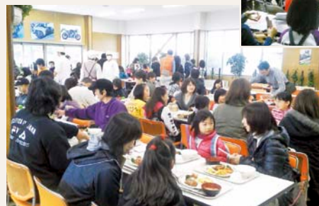
Akashi interaction group