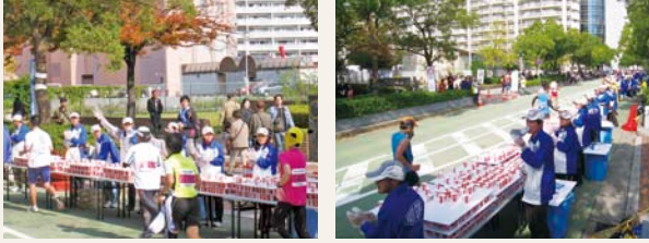
Volunteers at water station

KHI's corporate sponsorship for the inaugural Kobe Marathon 2011, held on November 20, 2011, in Kobe, was reflected on the men's number bibs. The Company was also represented by 86 volunteers who manned the water station and cheered the runners on from the sidelines.