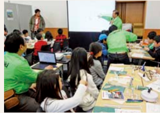
Making model helicopters

We showed the children how a helicopter and its rotor are assembled and estimated the rotor's lift force—the force that lifts the helicopter—and described some insider secrets, such as the trick to stop the whole helicopter from spinning.