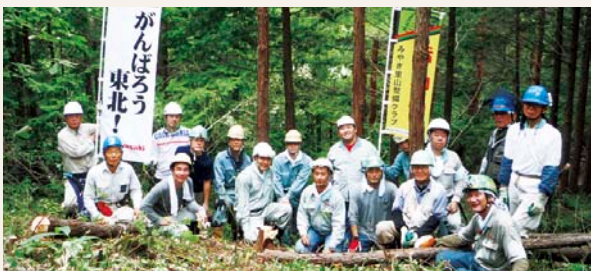
Community forest maintenance group