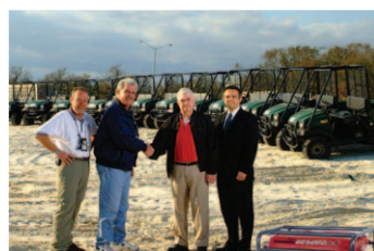
MULE utility vehicle