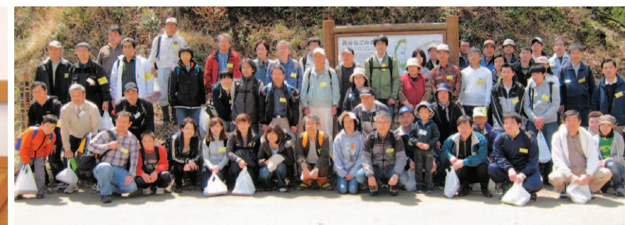
The third forest restoration event