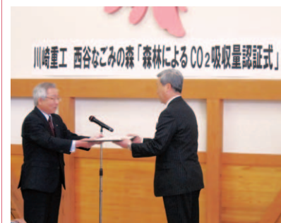
CO 2 removals certificate conferment ceremony

The municipality of Taka-cho has given us a CO 2 removals certificate indicating that 15.61 tons of CO 2 per year are removed from the atmosphere thanks to our maintenance activities such as forest thinning and cleaning cutting in FY2009.