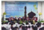
Halal bi halal

This demonstrates KMI efforts to accommodate the local religions, culture and customs of the land and execute business activities that respect human rights.