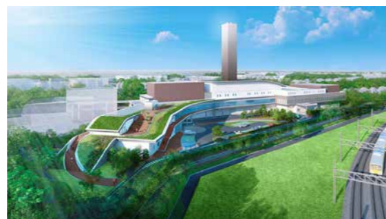
Simulated image of completed facilities

The facilities will feature an architectural design that harmonizes with nearby sites, such as the Tamagawa Josui Scenic Road and Nobidome Canal Historical and Environmental Preservation Area, and will provide spaces for relaxation and interpersonal exchanges that can be visited by the public. In these ways, Kawasaki hopes to achieve familiarity and acceptance