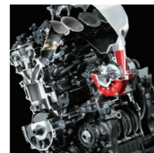
Supercharged engine for large motorcycles (Ninja H2R)