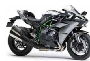
Ninja H2R/Ninja H2 (supercharged engine models)