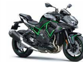
Ninja H2 SX/Z H2 (supercharged engine models)